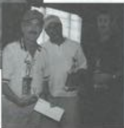
3 rd Place Team