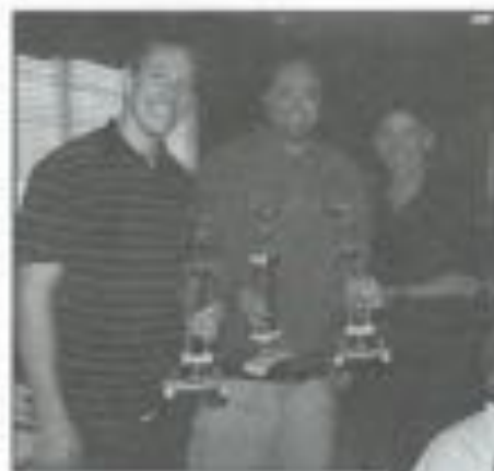
1 st Place Team