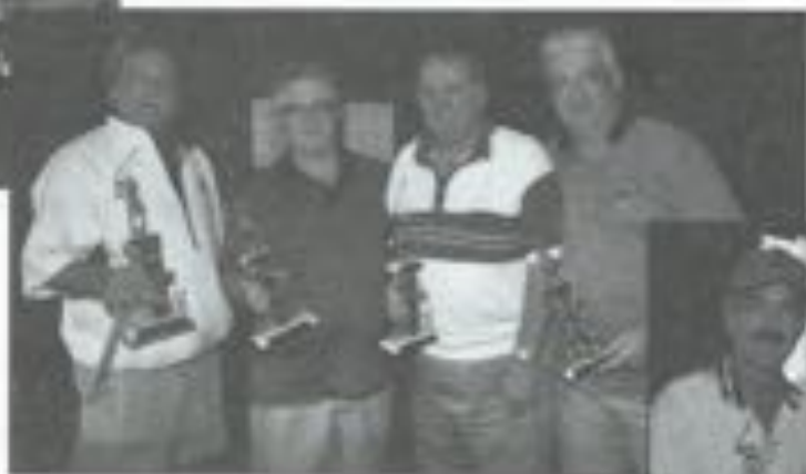
2 nd Place Team