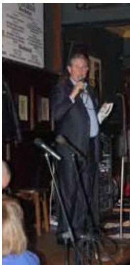
The Limerick Pub Wheaton, MD